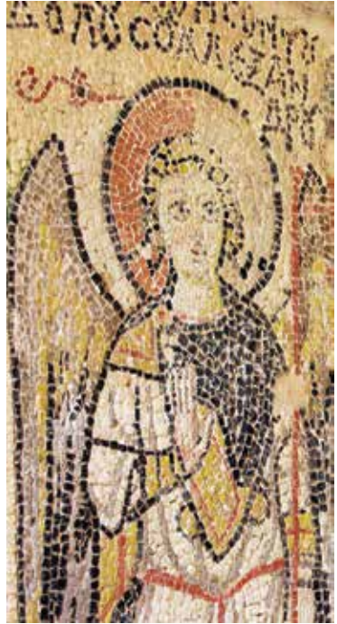
• The unique chapel inside the amphitheatre