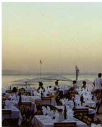
• Delicious Durrës