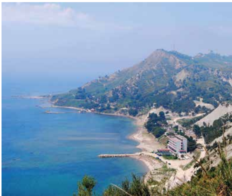
• One of the many beaches of Durrës

and arriving in Bologna at 05:58 next morning. The Palatino has sleeping-cars with 1, 2 & 3-bed rooms, modern 4-berth ‘comfort’ couchette and standard 6-berth couchettes.