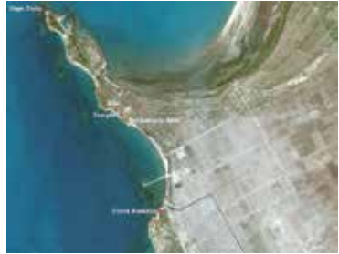
• The map of several archaeological expeditions

To reach there, you will first have to take the old Durres-Tirana road, and head for the Shkozet city-quarter. Once arriving at the rotunda, take right, and ride briefly along the road linking Shkozet with the