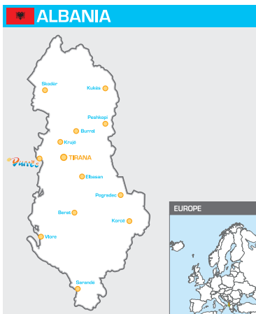
• Map of Albania; Durrës, Albania's Westcoast

Tirana Airport taxi service is provided by ATEx shpk. The service is profes-