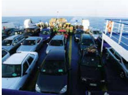
• A ferry coming in Durrës